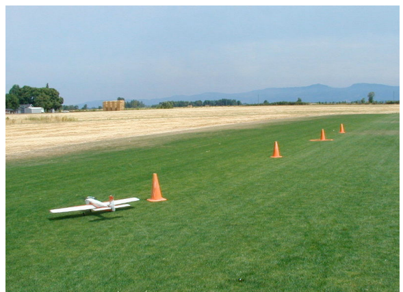
Jim Corbett photos