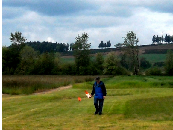
Retrieving aircraft after a successful flight