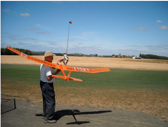
Ready to launch using a High Start