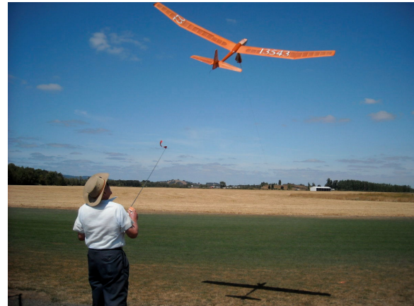
Up and away.