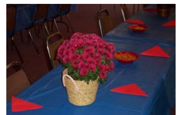
A Raffle Prize