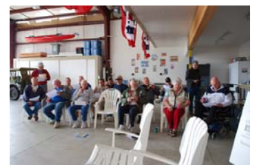
The Meeting Group