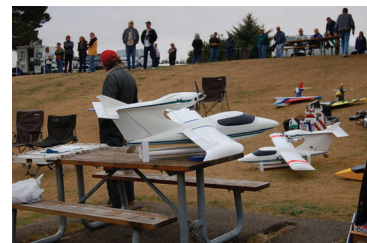
Great Planes Seawind