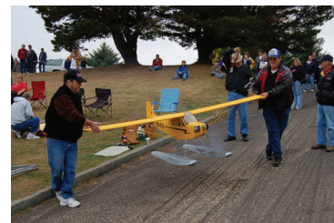
Balsa USA Cub

I hope that we can continue this great event each year.