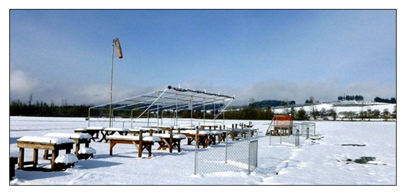
Didn't fly today, no skis!!!!