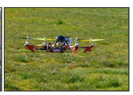
Affiline Field March 10<sup>th</sup> - Mel Graham JR photos - Perfect touch and go weather! 15-25 mph winds