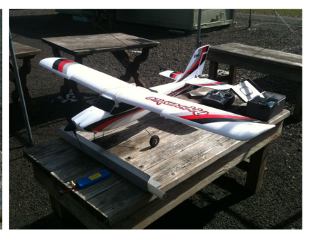
At the Field March 8th