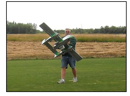
The smile says it all!