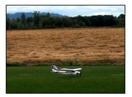
Nice landing also