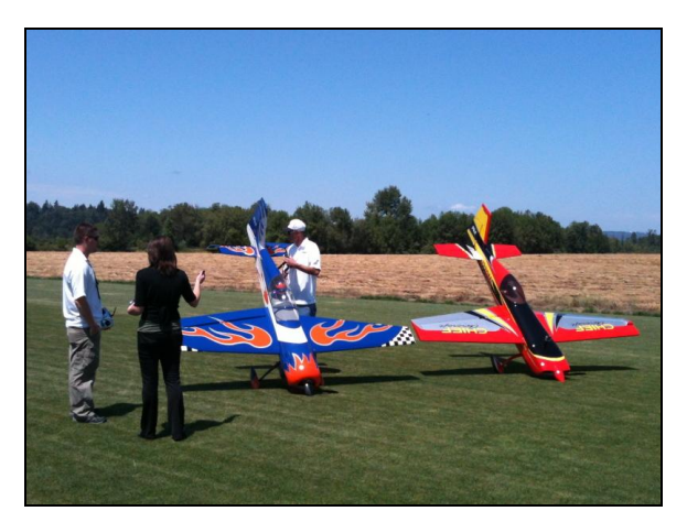
Chief Aircraft Big Birds.

18 pilots signed in, 100 plus spectators enjoyed the flying and good weather. Two of the local television stations covered the event. See full report on eugenerc.org.