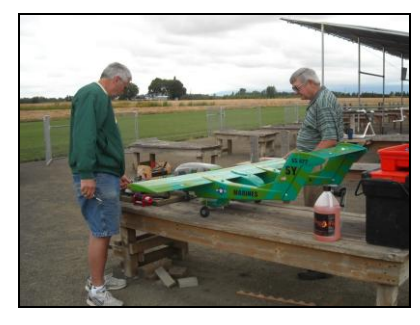
#2 running also