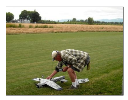
A two part landing